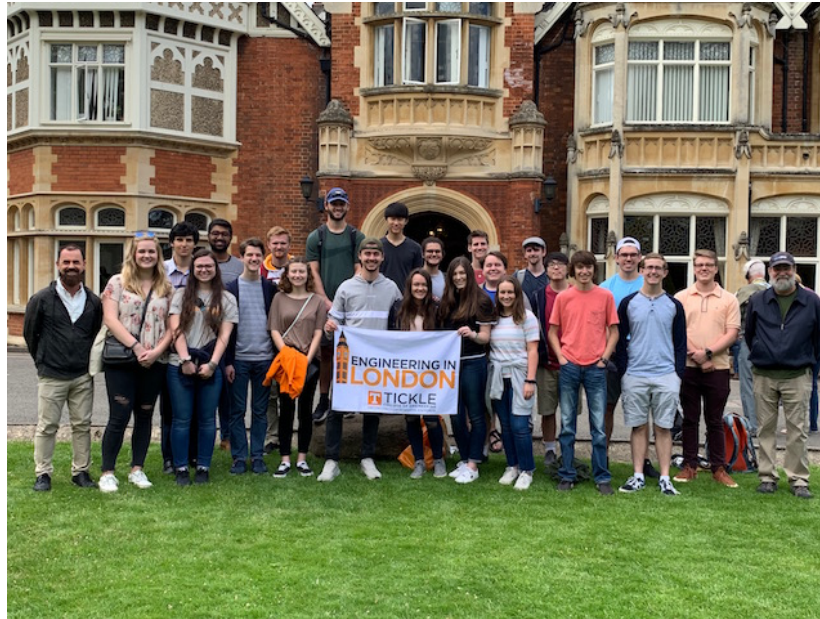
EIL 2019 Students and Faculty at Bletchley Park